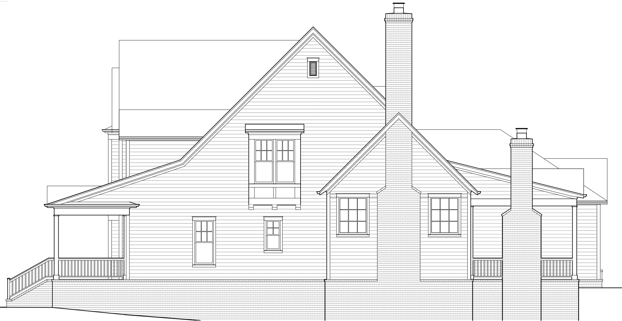
2 RIGHT ELEVATION 1/8" = 1'-0"