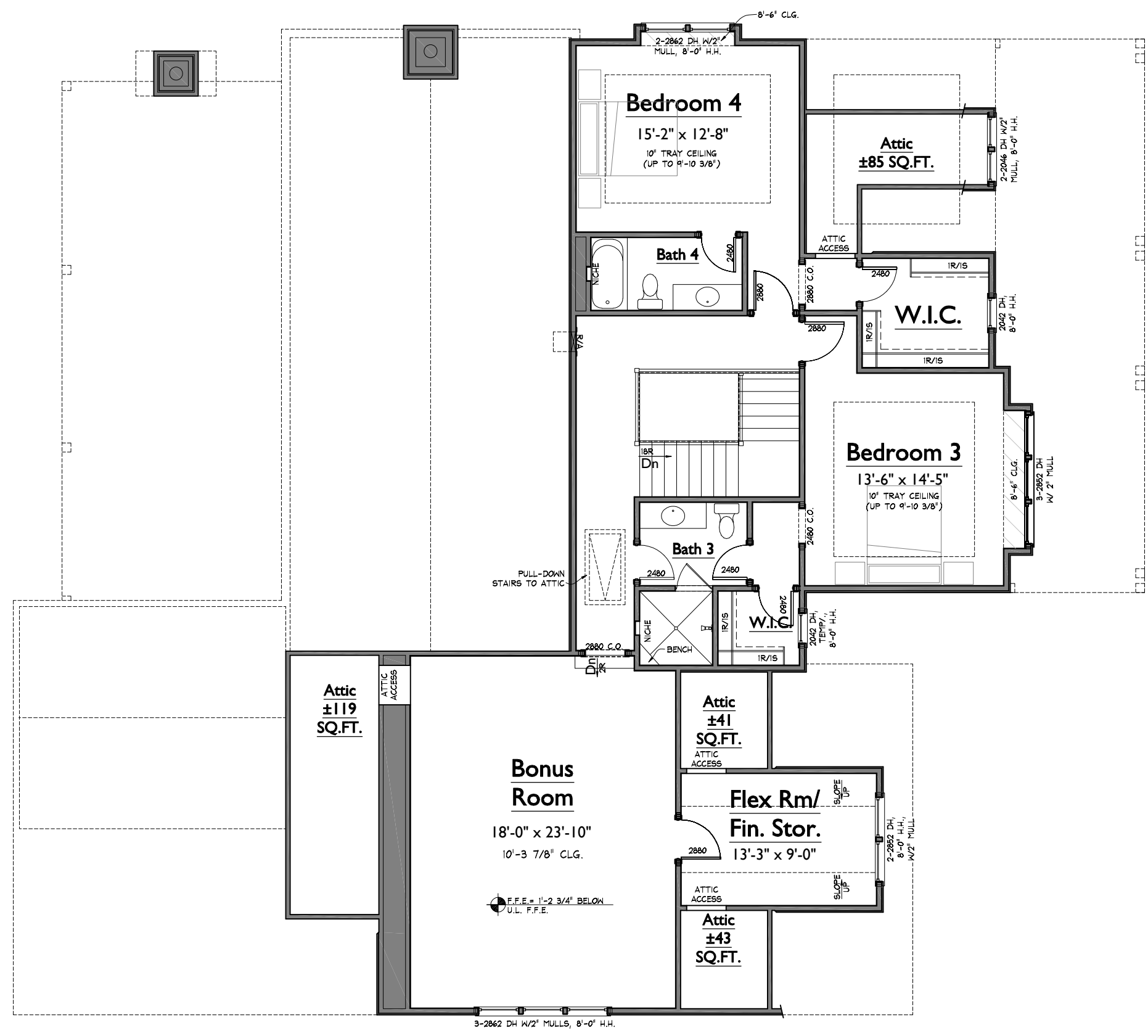
1 UPPER LEVEL FLOOR PLAN 1/8" = 1'-0"