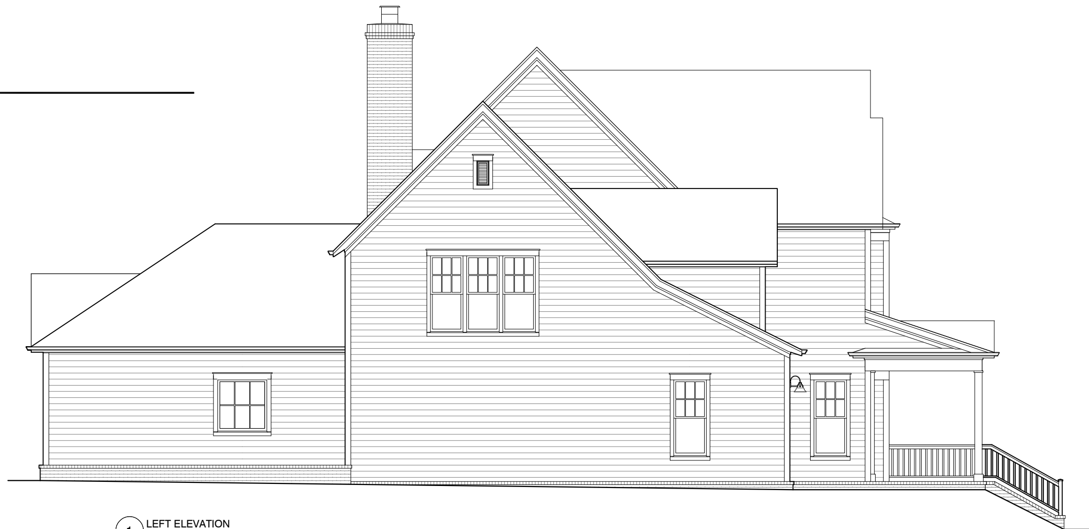
1 LEFT ELEVATION 1/8" = 1'-0"

GROVE LOT 9007 8684 BELLADONNA DRIVE CASSIA