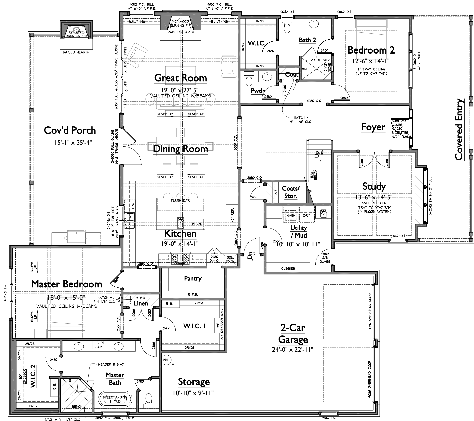
1 LOWER LEVEL FLOOR PLAN 1/8" = 1'-0"