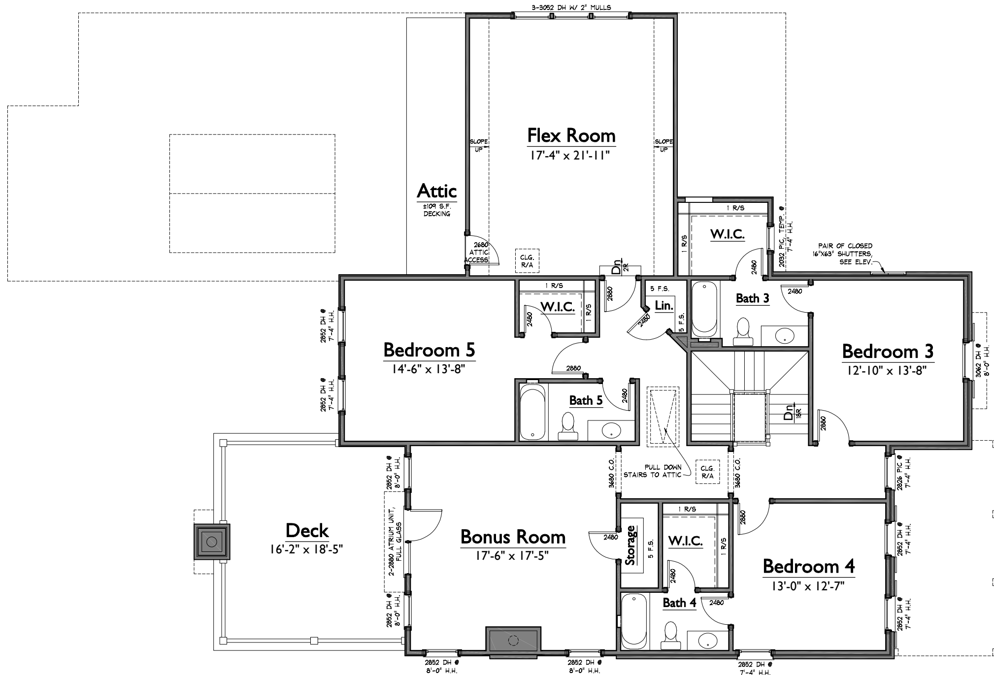
1 UPPER LEVEL FLOOR PLAN 1/8" = 1'-0"