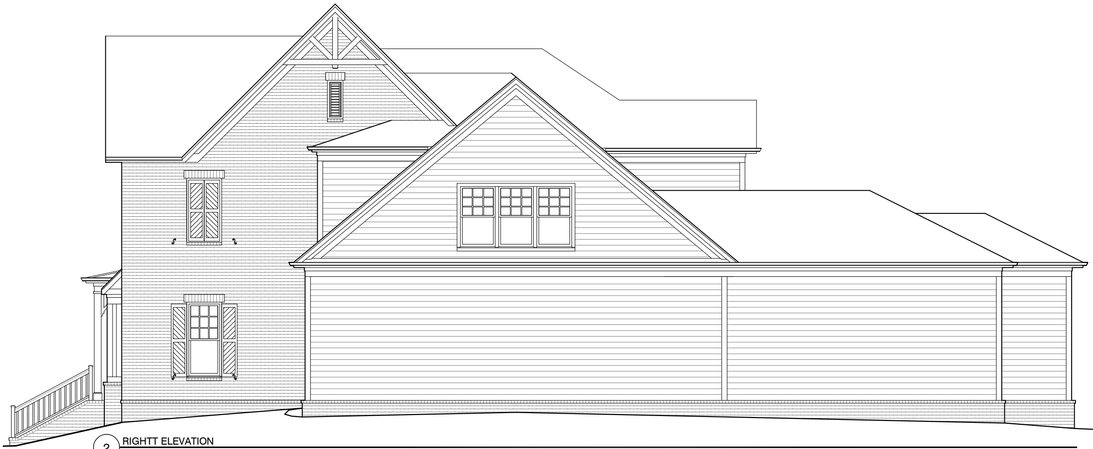
2 RIGHT ELEVATION 1/8" = 1'-0"