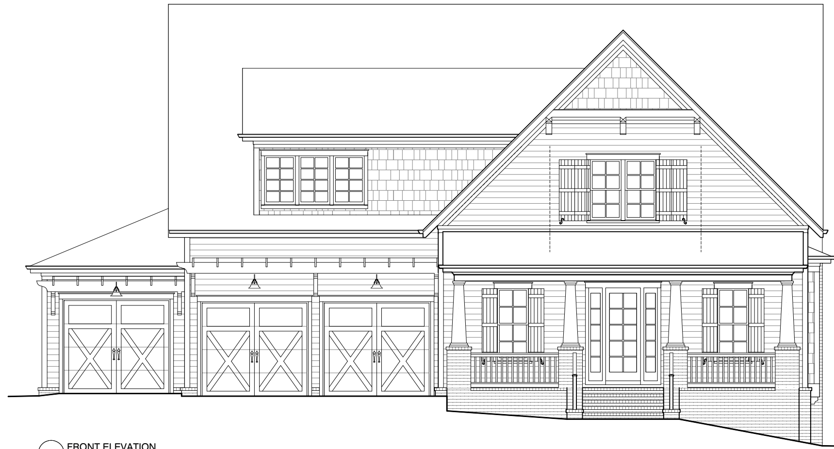
1 FRONT ELEVATION 1/8" = 1'-0"

THE GROVE 9008 8688 BELLADONNA DRIVE CAMELLIA