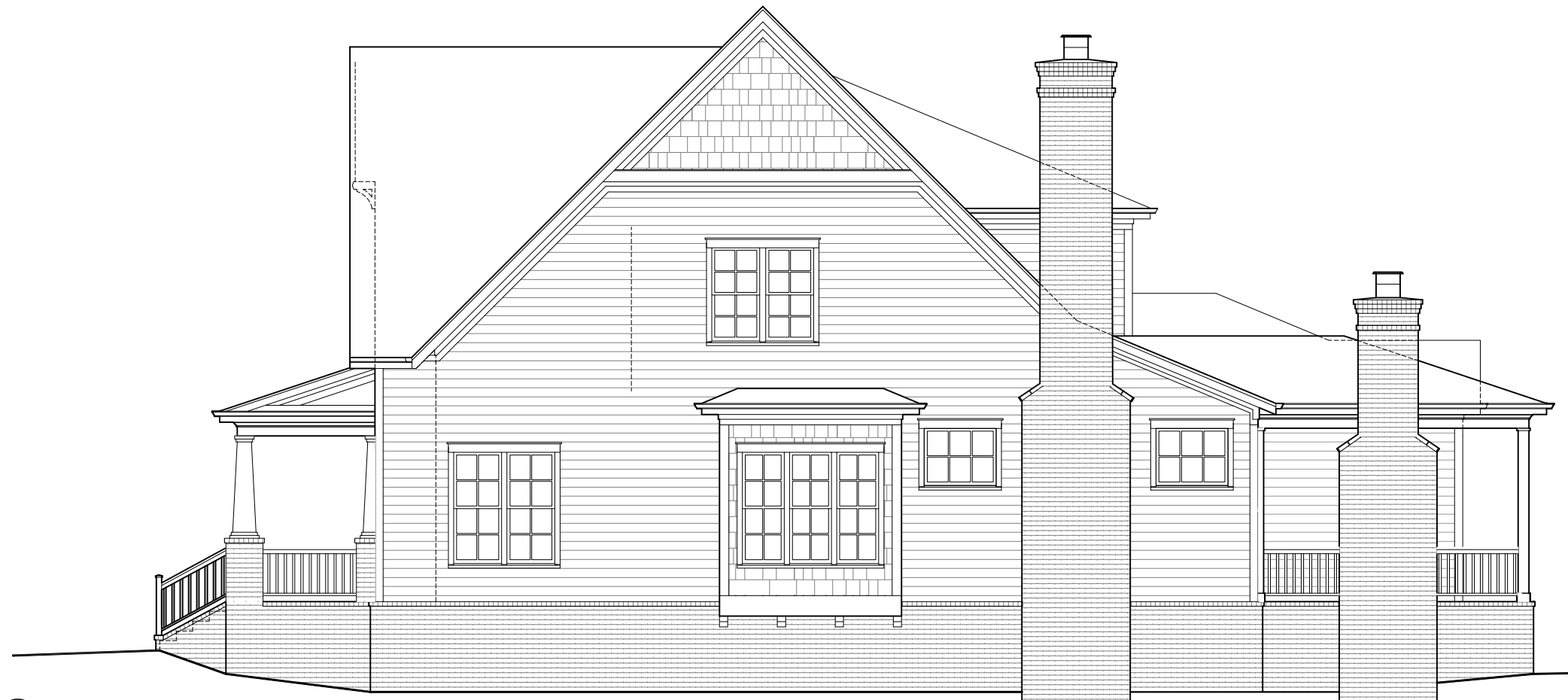
2 RIGHT ELEVATION 1/8" = 1'-0"