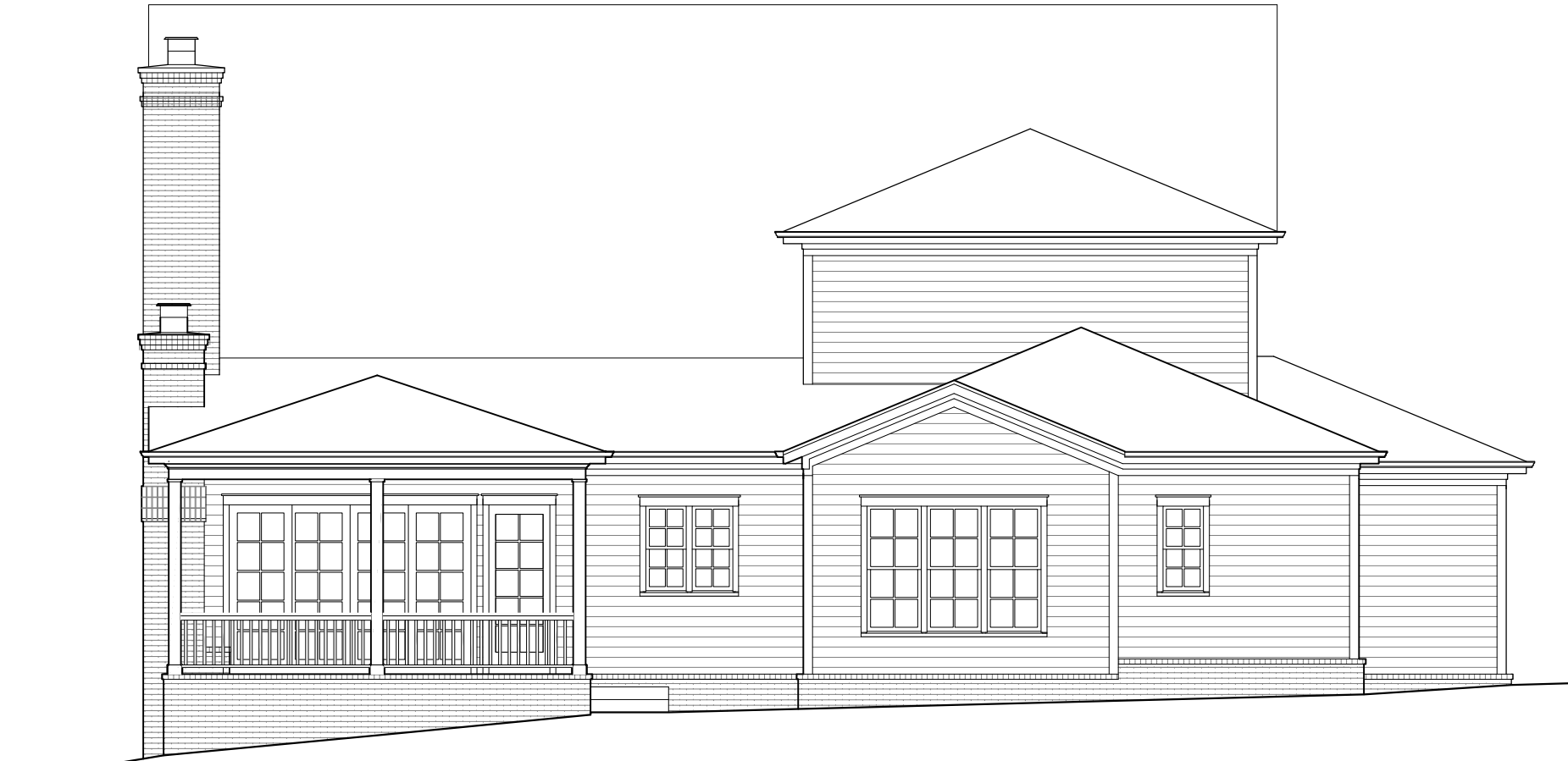
2 REAR ELEVATION 1/8" = 1'-0"