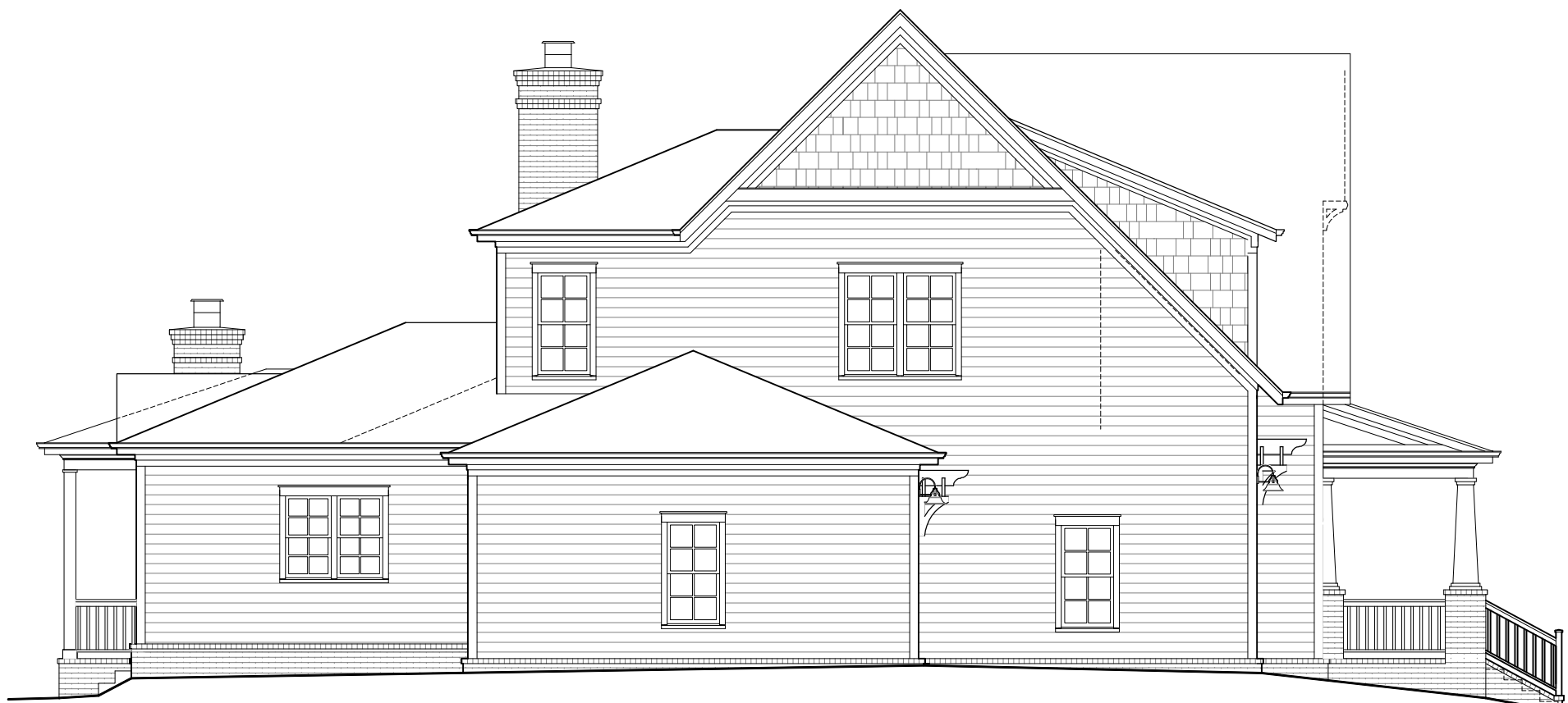
1 LEFT ELEVATION 1/8" = 1'-0"

THE GROVE 9008 8688 BELLADONNA DRIVE CAMELLIA 9008