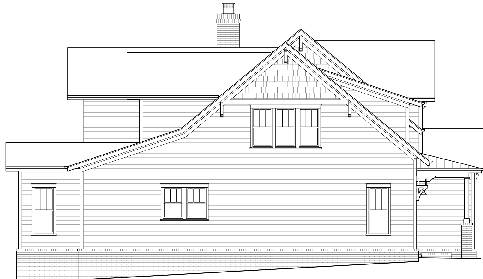
1 LEFT ELEVATION 1/8" = 1'-0"

THE GROVE LOT 9016 8720 BELLADONNA DRIVE "AMARYLLIS" PLAN