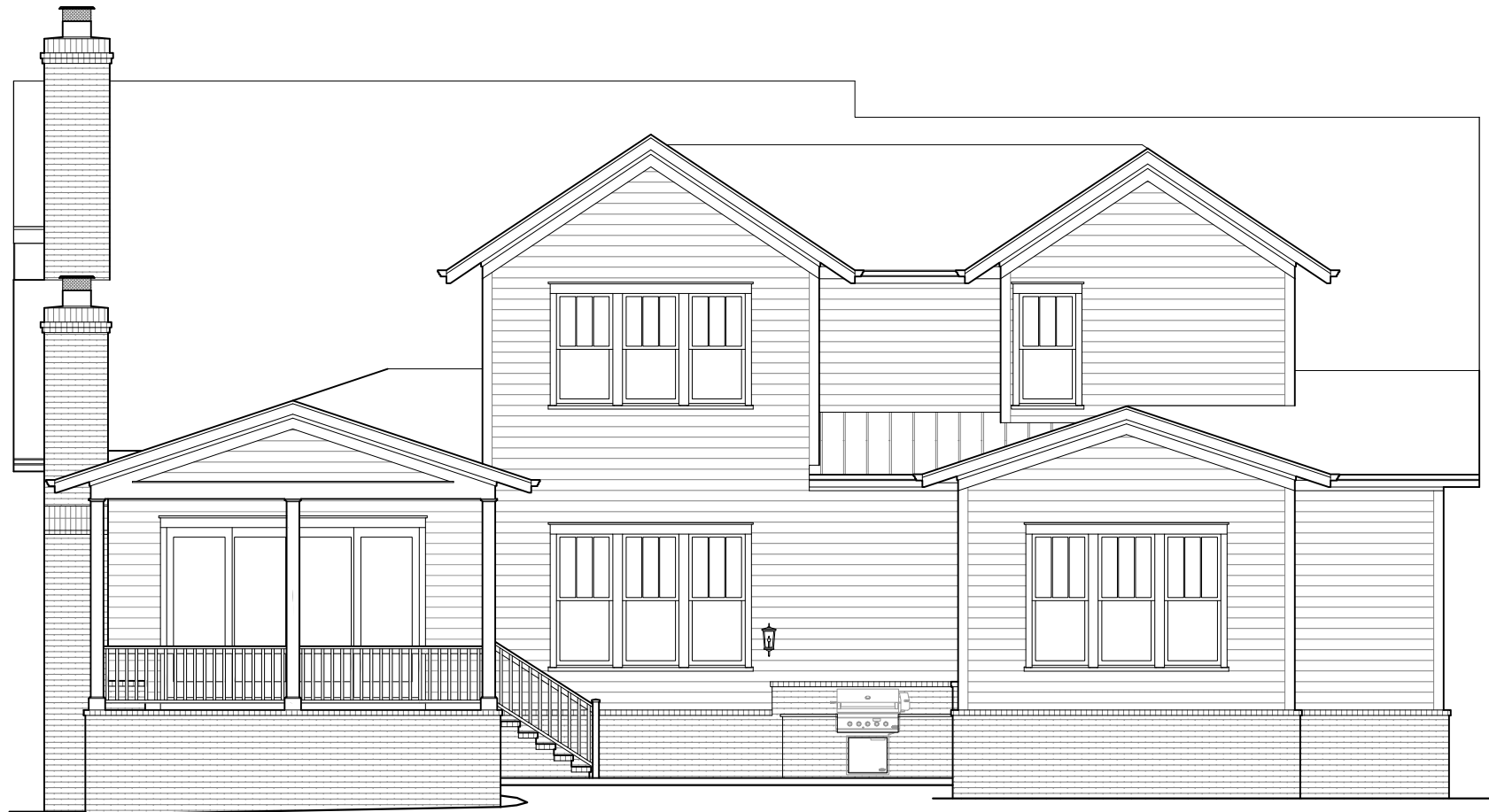
2 REAR ELEVATION 1/8" = 1'-0"