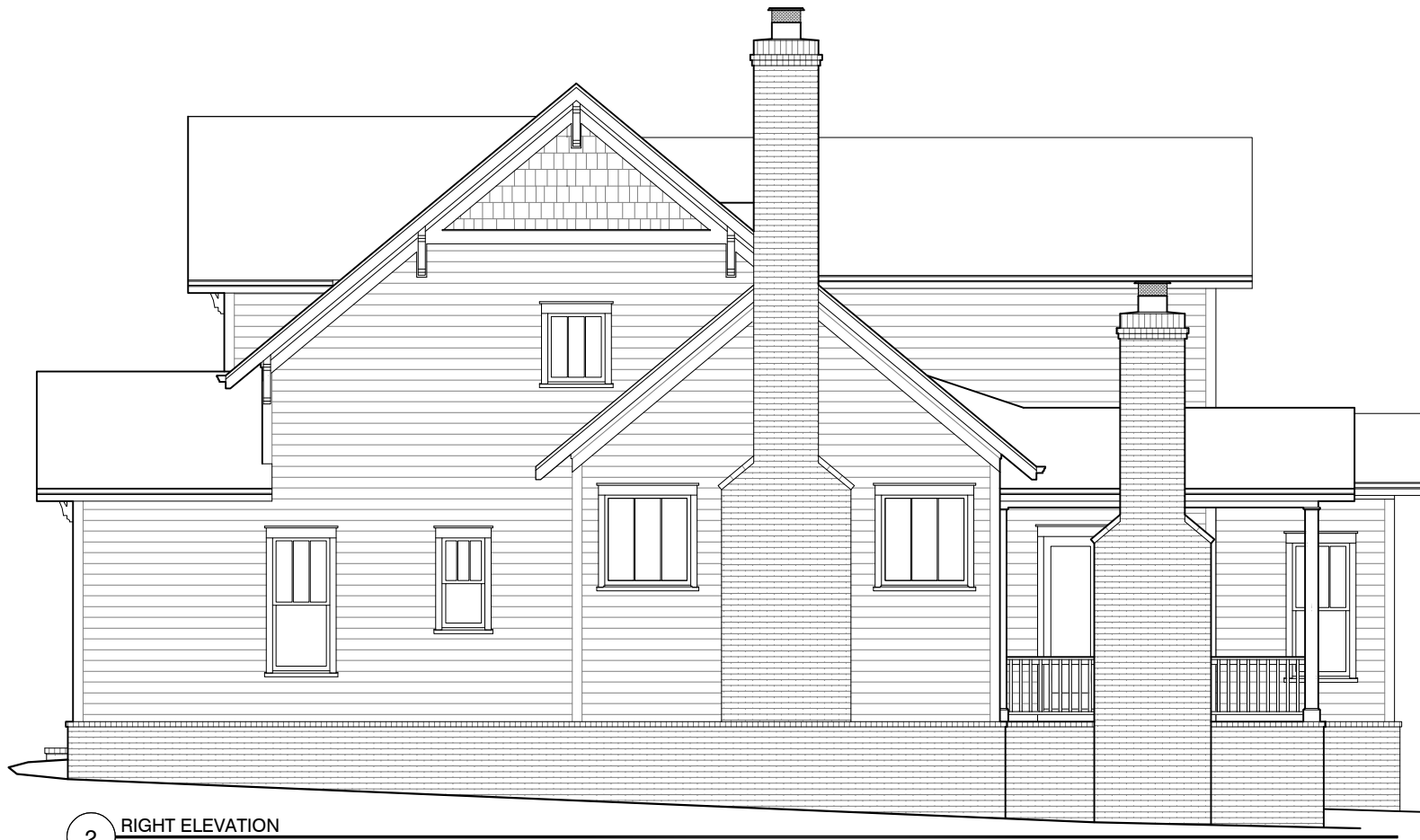
2 RIGHT ELEVATION 1/8" = 1'-0"