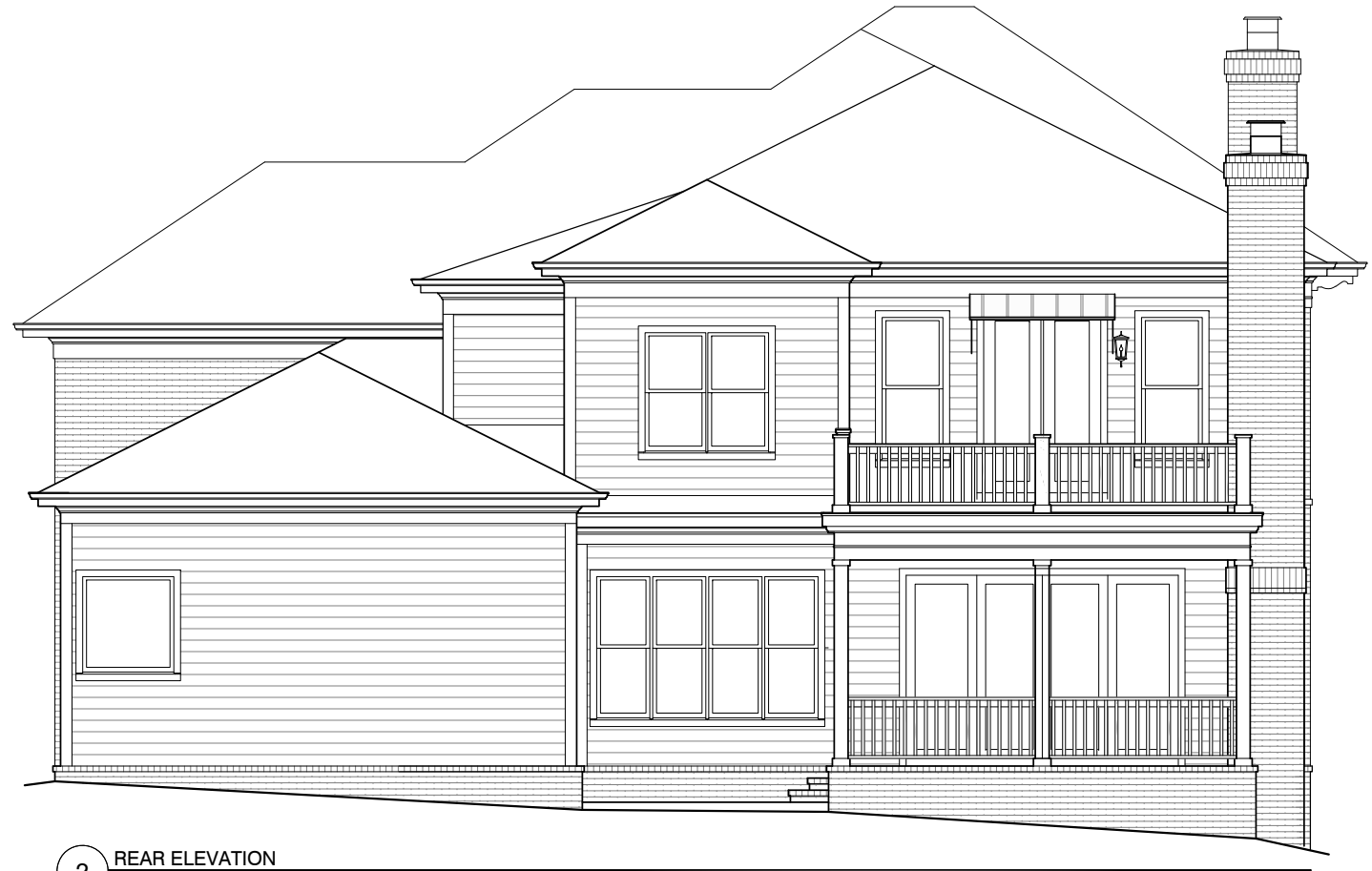
2 REAR ELEVATION 1/8" = 1'-0"