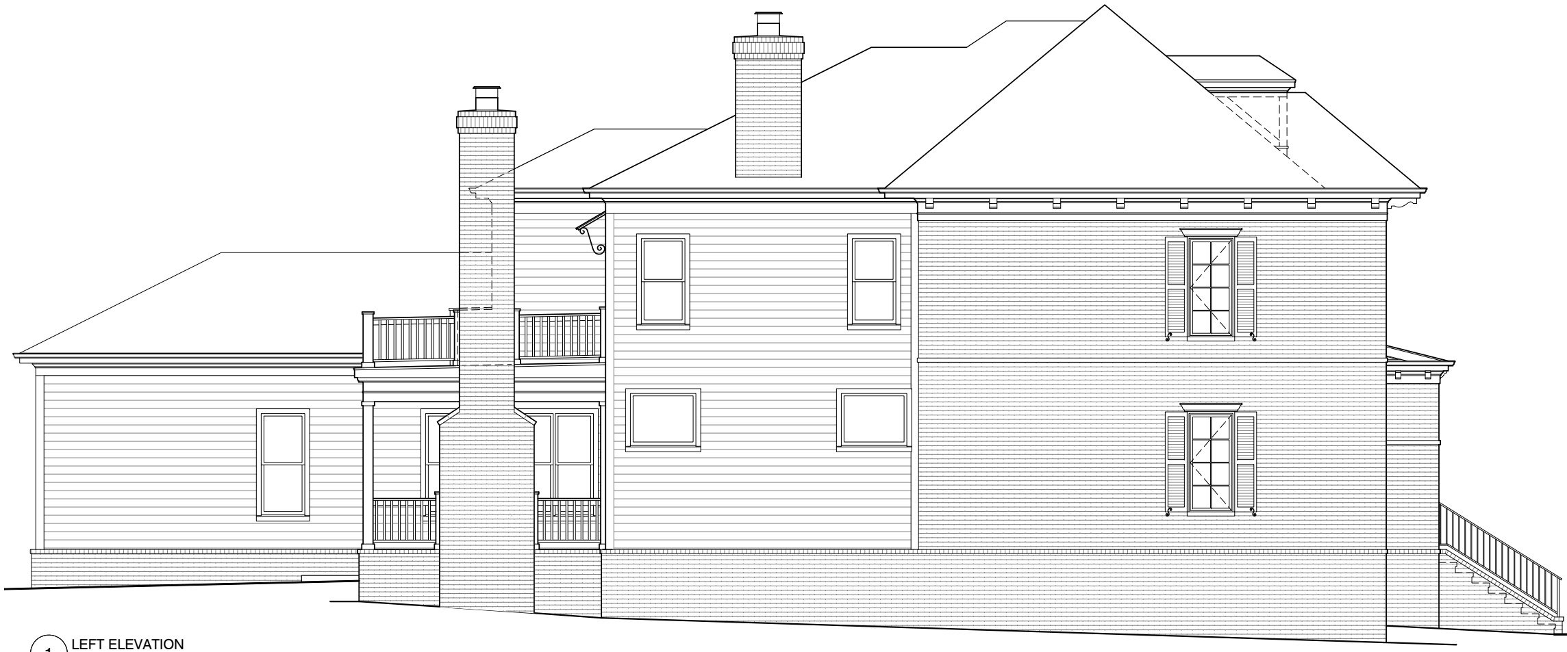
1 LEFT ELEVATION 1/8" = 1'-0"