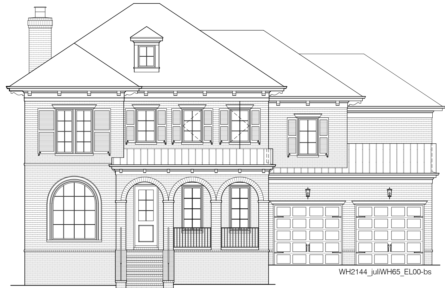
1 FRONT ELEVATION 1/8" = 1'-0"