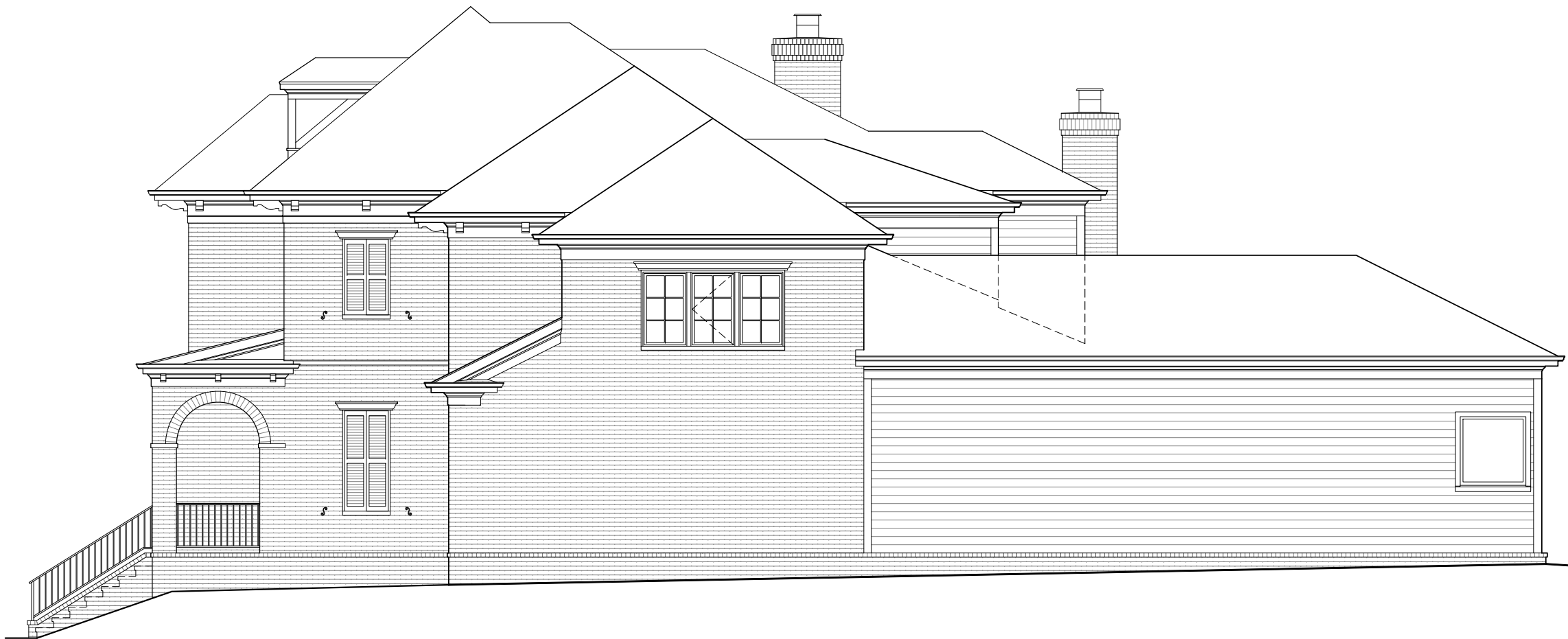
2 RIGHT ELEVATION 1/8" = 1'-0"