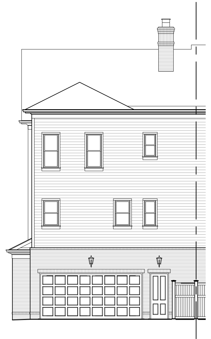
AUTO COURT ELEVATION