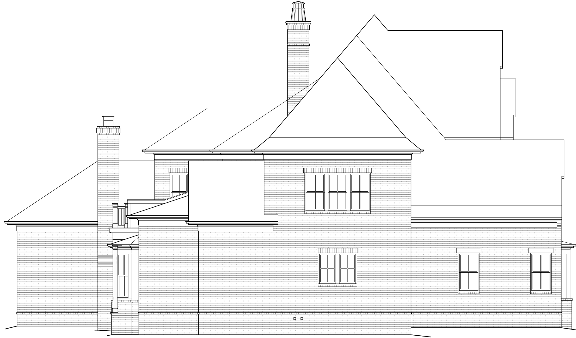
2 REAR ELEVATION 1/8" = 1'-0"