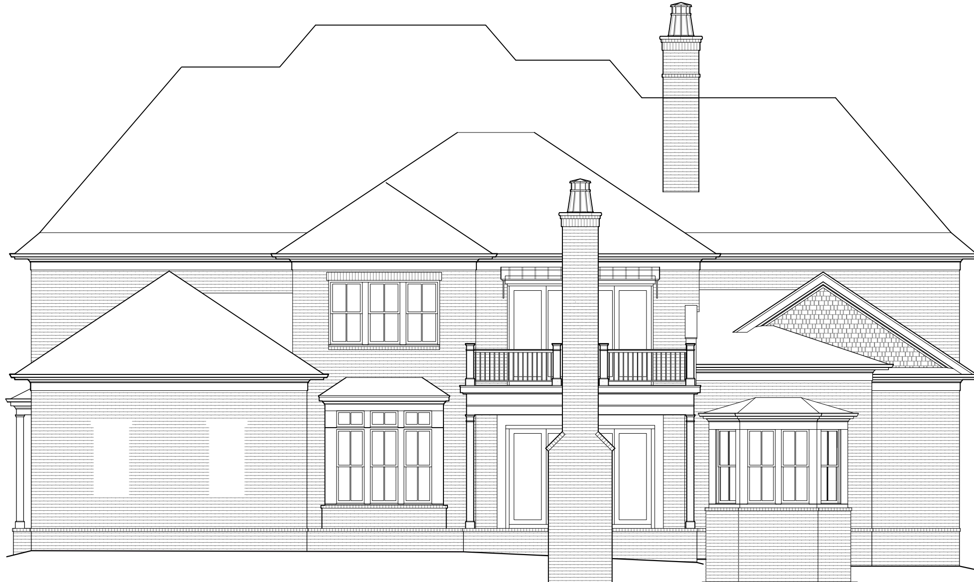
1 LEFT ELEVATION 1/8" = 1'-0"