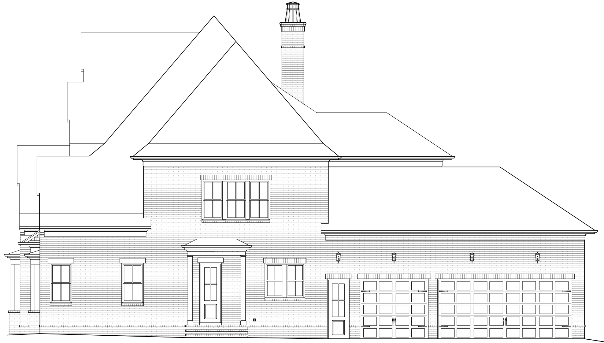
2 RIGHT ELEVATION 1/8" = 1'-0"