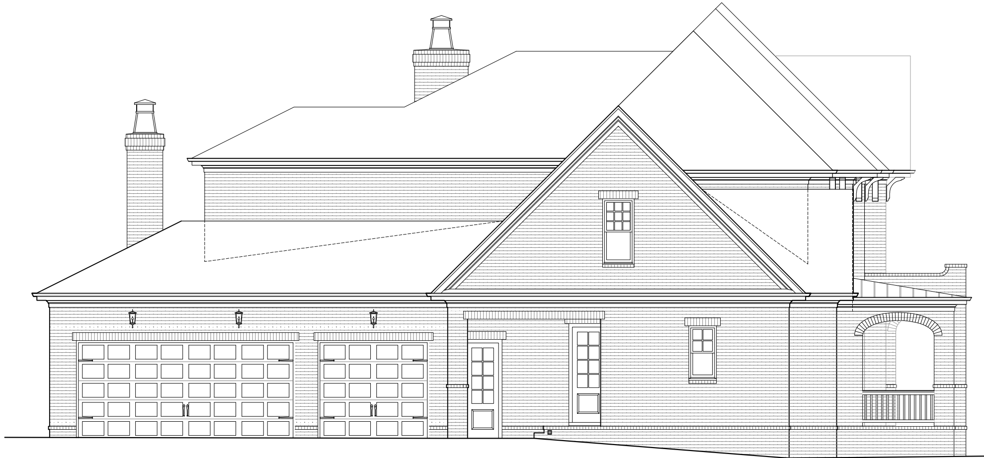
2 RIGHT ELEVATION 1/8" = 1'-0"