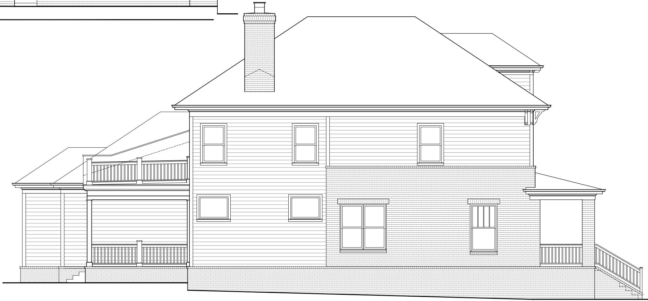
1 LEFT ELEVATION 1/8" = 1'-0"

WESTHAVEN LOT 1877 635 JASPER AVENUE CAMILLE 65 WH1877_camiWH65 LAST CHECKED: 04.19.2018 ACPG