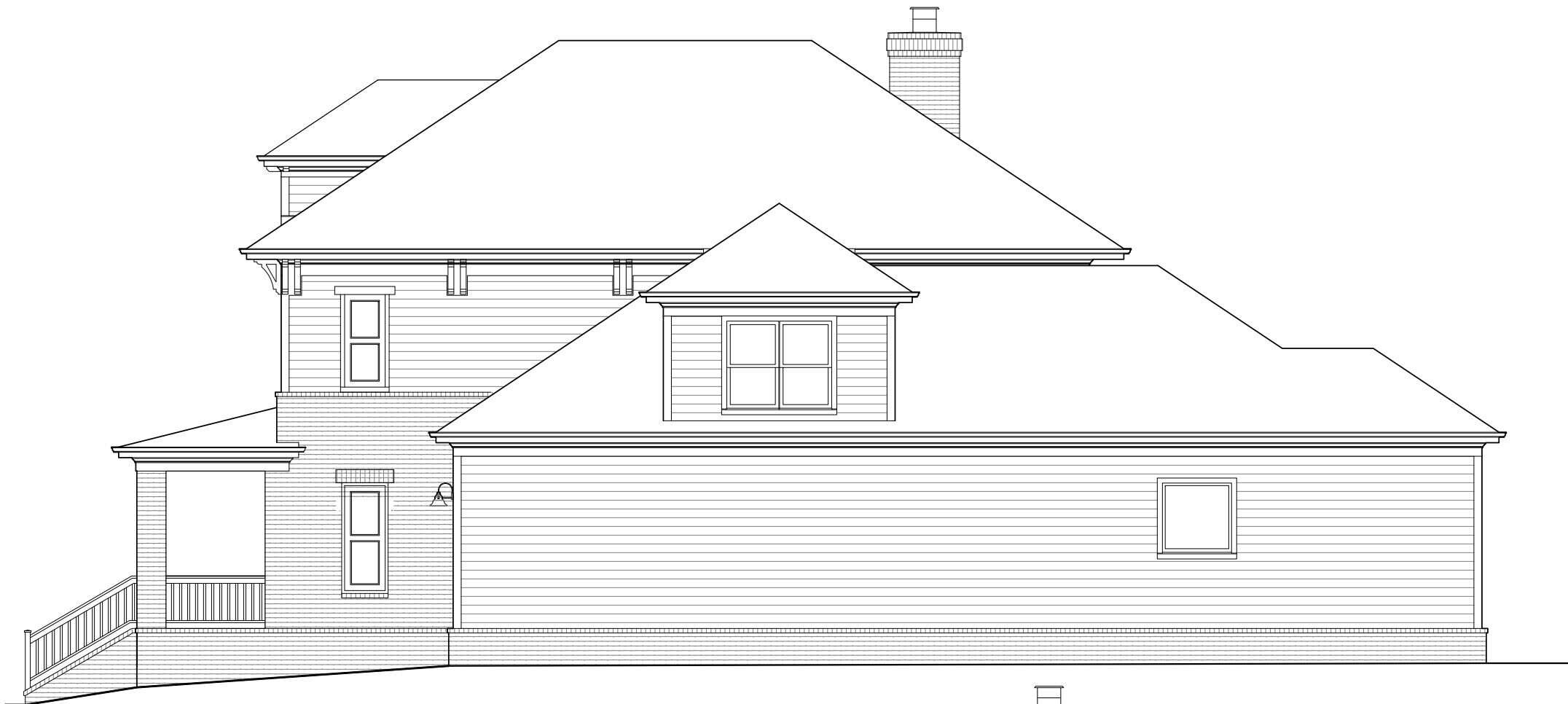
2 RIGHT ELEVATION 1/8" = 1'-0"