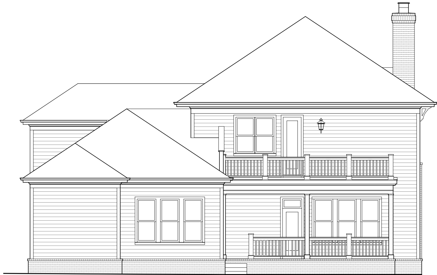
2 REAR ELEVATION 1/8" = 1'-0"