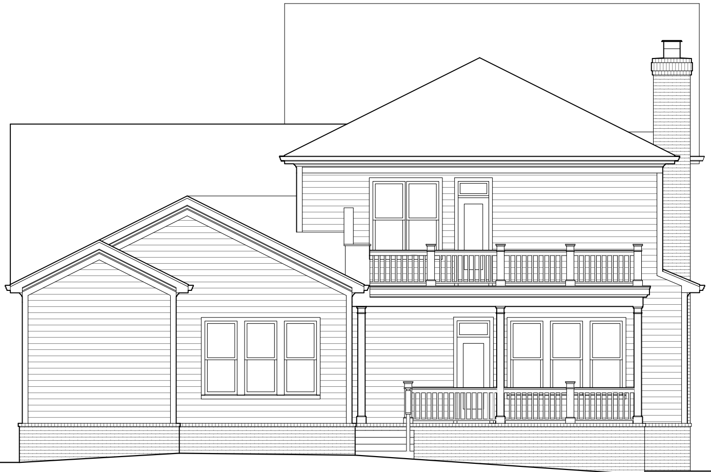
2 REAR ELEVATION 1/4" = 1'-0"

S:\Projects\Westhaven\Sec 3\WH1338_cami\WH65X_B512.sdw Troy Tamets 01/25/18 - 9:42 A