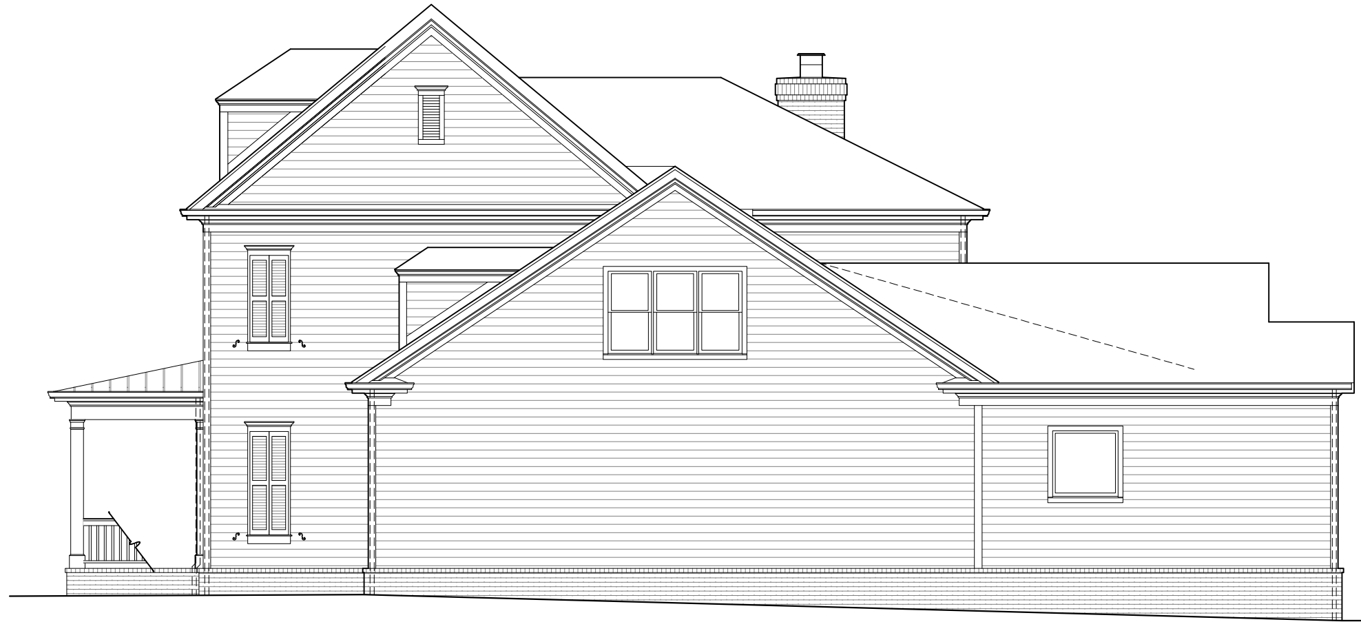
2 RIGHT ELEVATION 1/4" = 1'-0"