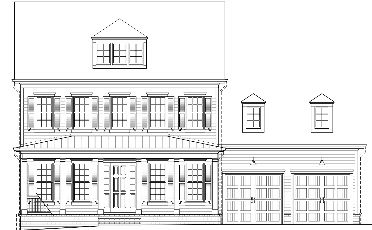
1 FRONT ELEVATION 1/4" = 1'-0"

WESTHAVEN LOT 1338 812 STONEWATER BLVD. CAMILLE PLAN WH1338_camiWH65