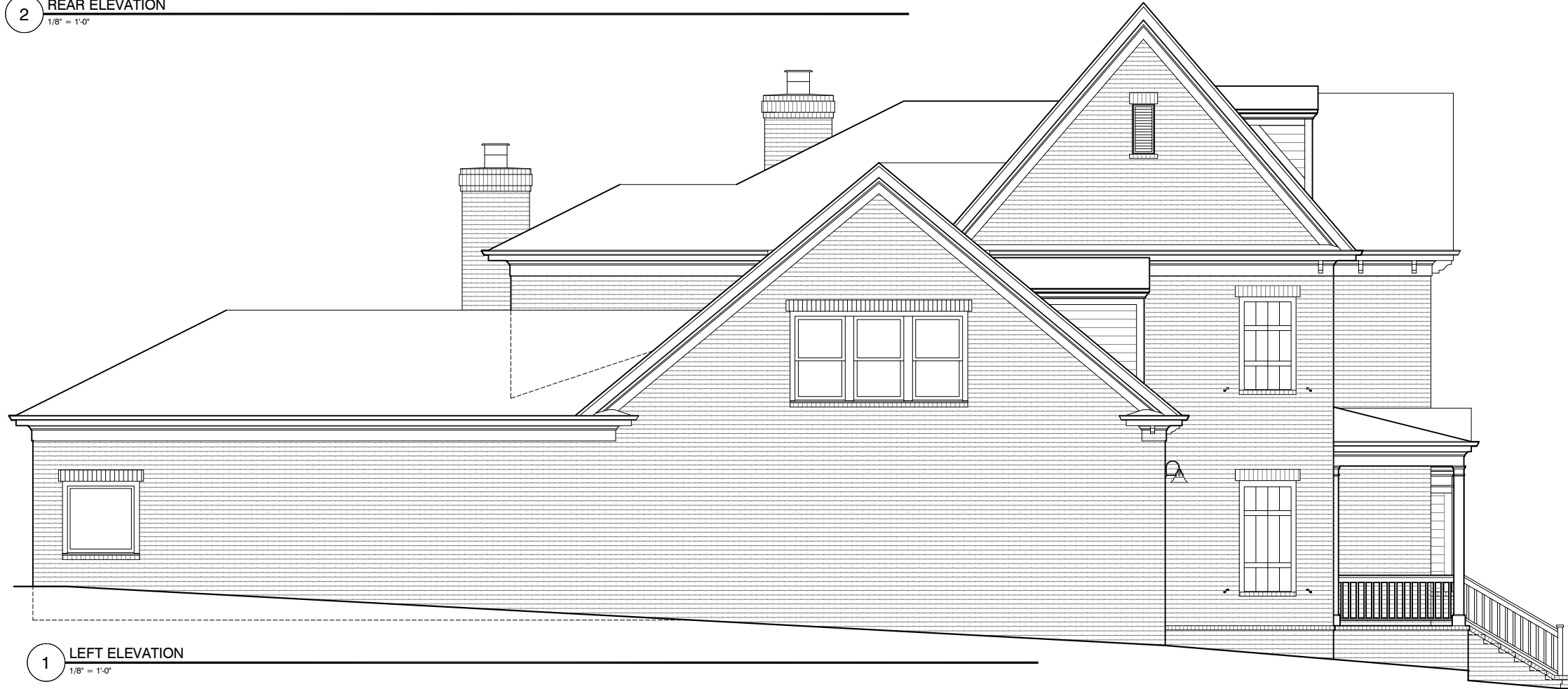
1 LEFT ELEVATION 1/8" = 1'-0"

WESTHAVEN LOT 1303 1583 WESTHAVEN BLVD. JULIANNE 65 WH1303 LAST CHECKED: 11.09.2017 JRP