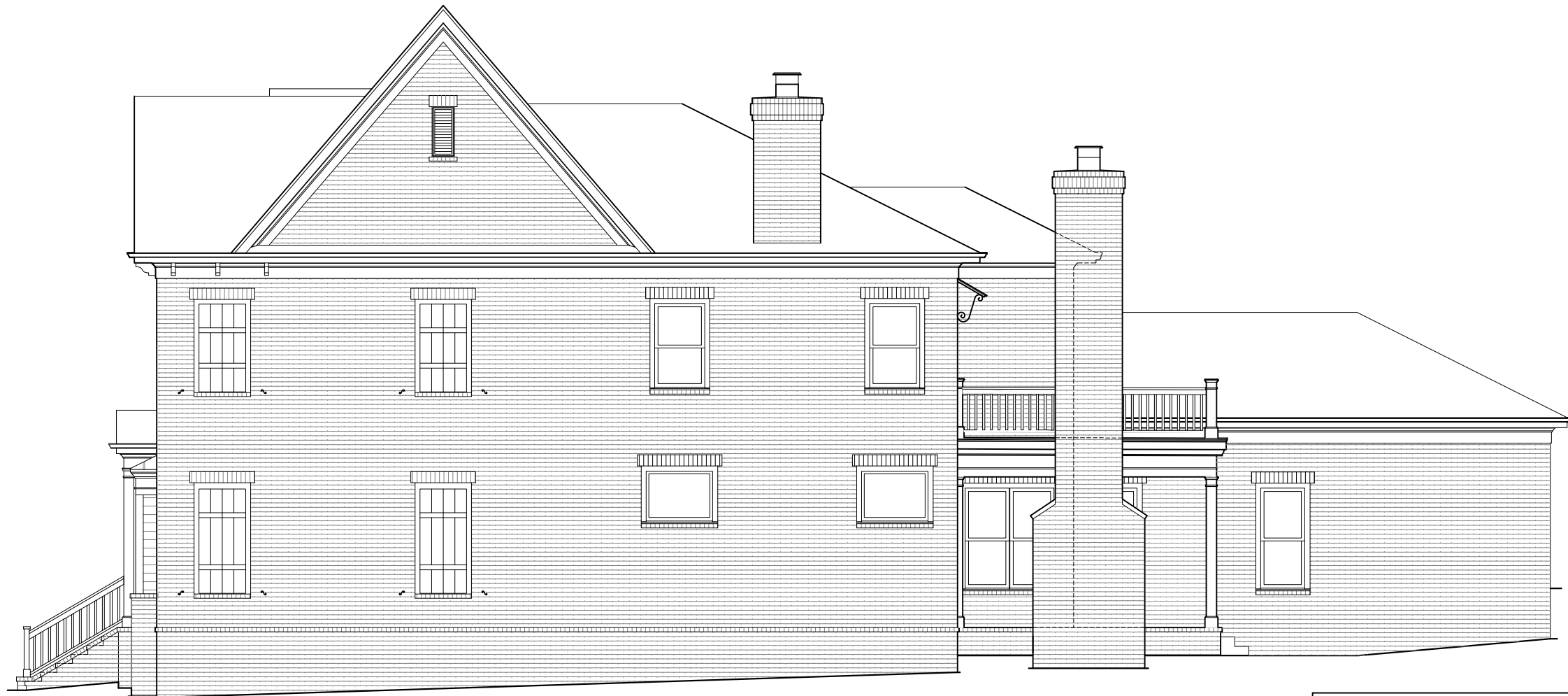
2 RIGHT ELEVATION 1/8" = 1'-0"