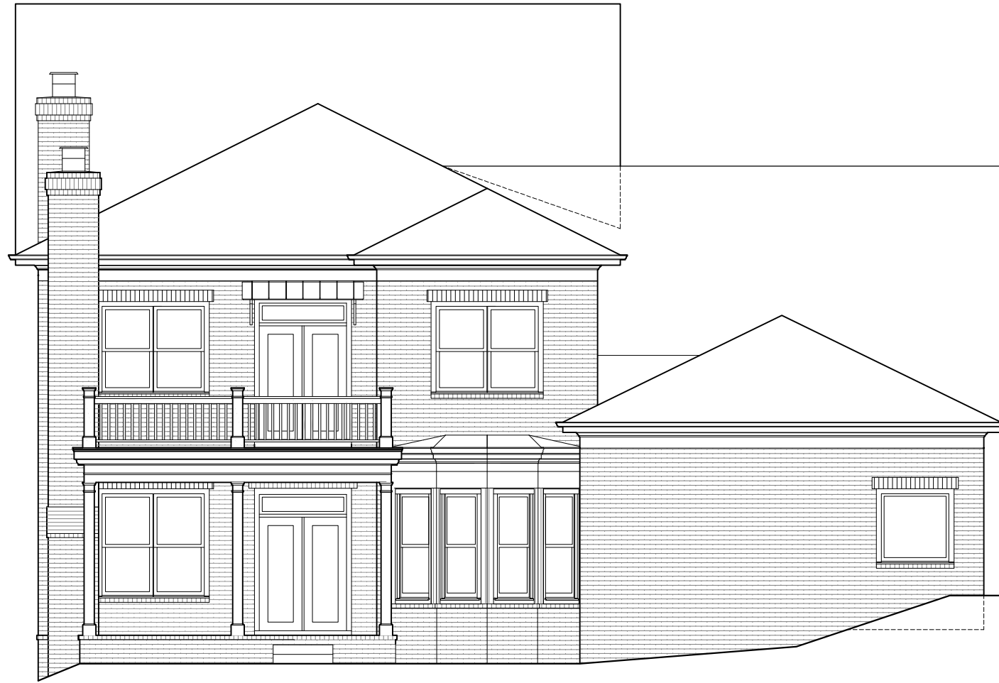
2 REAR ELEVATION 1/8" = 1'-0"