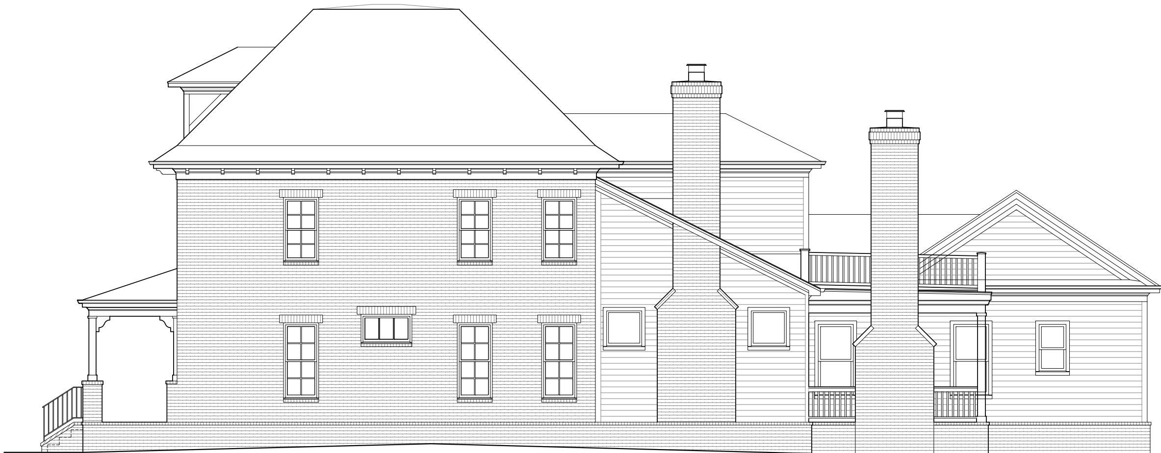
2 RIGHT ELEVATION 1/8" = 1'-0"