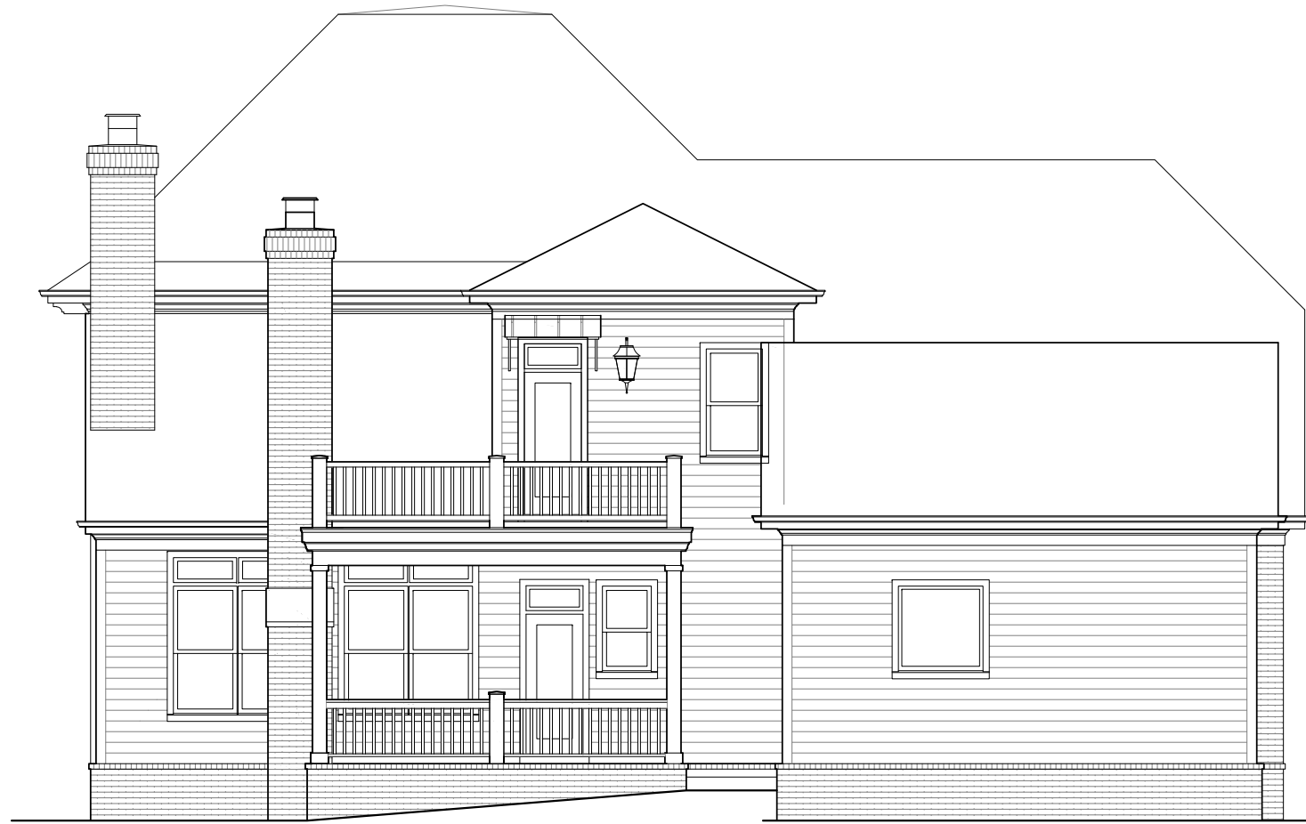
2 REAR ELEVATION 1/8" = 1'-0"