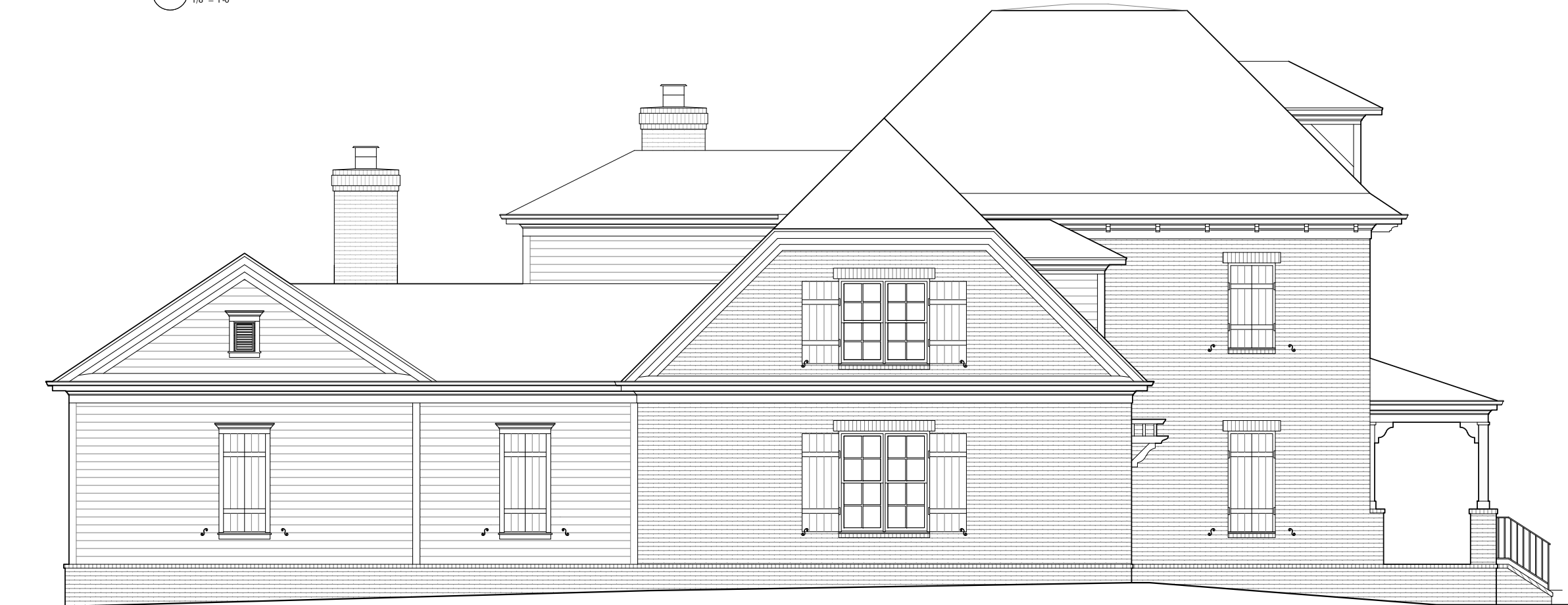
1 LEFT ELEVATION 1/8" = 1'-0"